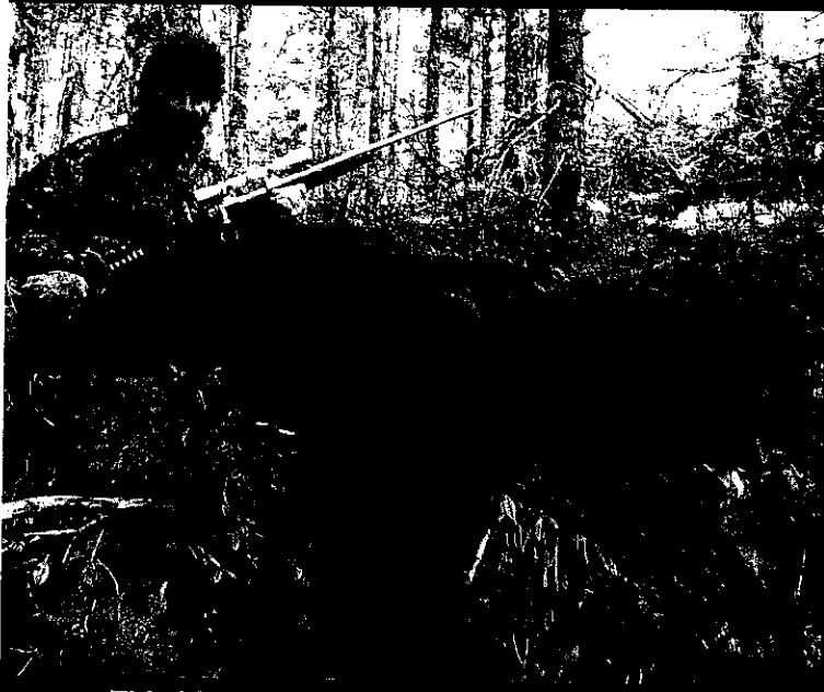
This big Newfoundland bear scored 21 11/16-inches by SCI and was taken during the 2007 season.

How big are the black bears of Newfoundland? I arrowed a record-book bruin several years ago on a two-week bow hunt with Ray's Hunting and Fishing Lodge on the west side of the island. Although that bear tipped the scales around 425 pounds, I saw several other bears that easily dwarfed him, includ-