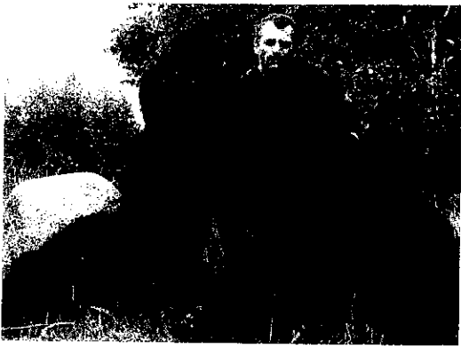
There is great potential for a record book bear from Newfoundland. This one was taken in 2007 and scored over 22-inches.

above the rim of a standing 55 gallon drum. We also stumbled upon a road kill that measured nine feet from the tip of his nose to the base of his tail. Now, those are big black bears anywhere!"