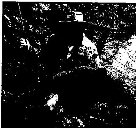
18 9/16", 400 lbs